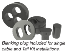
Blanking plug included for single cable and Tail Kit installations.