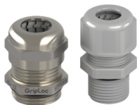
Multi-Tail or Flat Form Insert

Remora Flat Form and Tail Kits are supplied complete with: